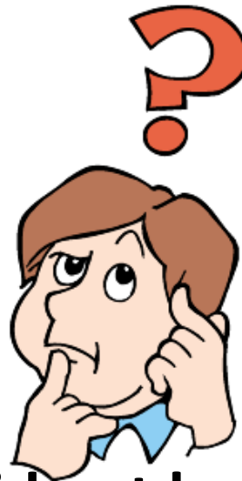
Did not know what to do