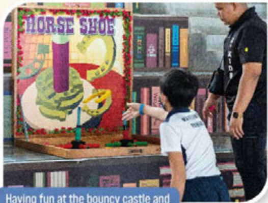
Having fun at the bouncy castle and the different carnival games

The Annual Games Day which was held in conjunction with the Children's Day Celebration was a happy occasion for students and staff. The past two editions of Games Day were held on a smaller scale due to the pandemic. After the two-year hiatus, the PE department brought back the joy and thrill of Games Day to Mayflower.