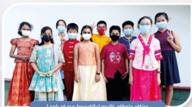
Look at our beautiful multi-ethnic attire during Racial Harmony Day!