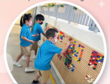
Solving problems on Peg-gy's Wall

We finally have our MK ' Music & Movement Room ' where the children are exposed to different music and songs. The activities create a very jovial atmosphere as they sing along with our teachers to different tunes and sometimes dance spontaneously with joyful hearts, while improving their body coordination and artistic skills.