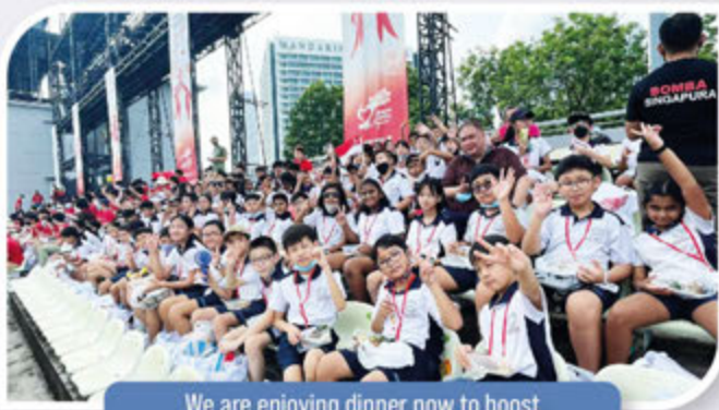
We are enjoying dinner now to boost our energy level for the party later.

NE Show finally made its comeback in 2022 after a two-year absence! Our excited and eager Primary 5 students attended the show at the Floating Platform @ Marina Bay on Saturday, 9 July. 176 students and 18 teachers were given the opportunity to witness the National Day Parade segment, look at the technologically advanced assets during the Total Defence displays, see the Red Lions' jump and be awed by the dazzling fireworks. Though the students and teachers arrived back in school around 10 p.m., one could still sense their excitement and joy after the show!