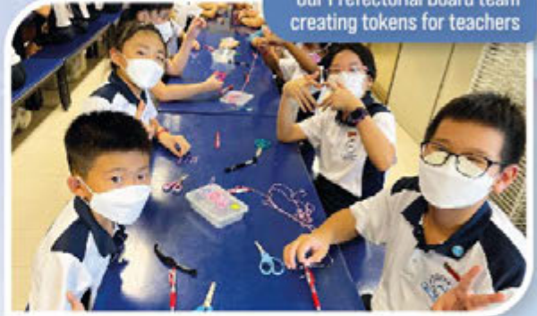
Our Prefectorial Board team creating tokens for teachers

With the theme, 'Teachers, We Are Grateful For YOU!', the day kicked off with dedications from students to their teachers over the Public Announcement system. Students expressed their gratitude to their teachers and were generous with their appreciation and praises for their teachers! After Morning Assembly, teachers and students engaged in a Class Bonding session. Students were thrilled when they discovered new things about their teachers through games.