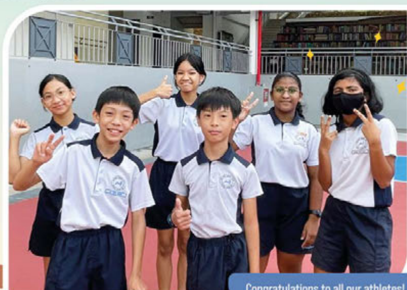
Congratulations to all our athletes!

Our track and field team brought back a slew of awards and achievements despite having many factors stacked against them. We are proud to have these students bringing glory to our school in the National School Games!