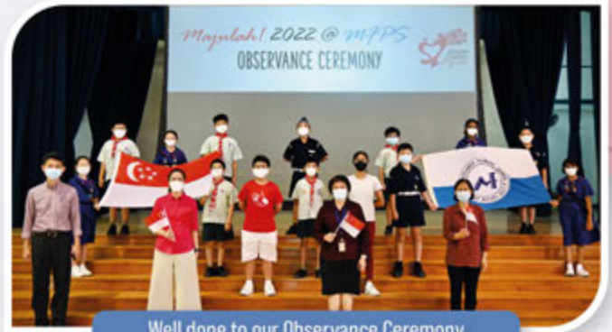
Well done to our Observance Ceremony 2022 flag contingent!