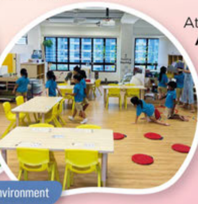
Learning in a fun environment

At MK@MF, we persist with a ' Can-Do Attitude ' to provide the best learning experiences for our children. We are truly proud of our entire team who have persisted and worked tirelessly over the past few months to create this masterpiece from a sheer blank canvas.