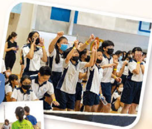
Lower primary students showcasing their skipping, throwing, bouncing & sprinting skills and cheering for their classmates

To complete the celebration, students were reminded to show gratitude as they honoured their grandparents for caring for them and shaping their development by designing a photo frame for them in the class bonding activities. Most importantly, everyone went home with smiles on their faces as the games brought great enjoyment to all.