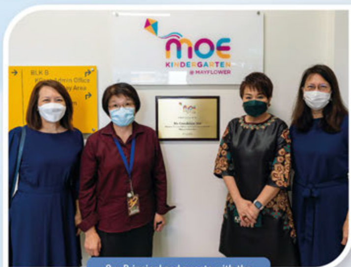
Our Principal and guests with the MK @ Mayflower Plaque

During the first week at our upgraded campus, our students penned their thoughts onto "Gratitude Jar" cards. They expressed words of gratitude and encouragement as well as their hopes and dreams for the future, and these "Gratitude Jar" cards were displayed in all the classrooms. We look forward to continuing our journey together at our new campus, daily creating exciting new stories together, and always with an attitude of gratitude.