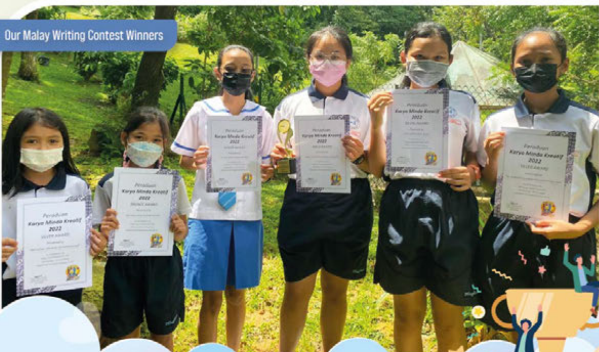
Our Malay Writing Contest Winners