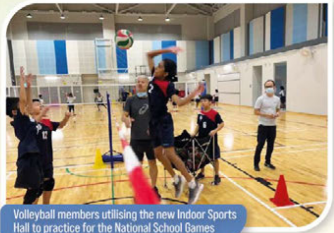
Volleyball members utilising the new Indoor Sports Hall to practice for the National School Games

The new facilities allowed students to practice better as they were able to train and rehearse in similar environments as the actual competition/performance venues.