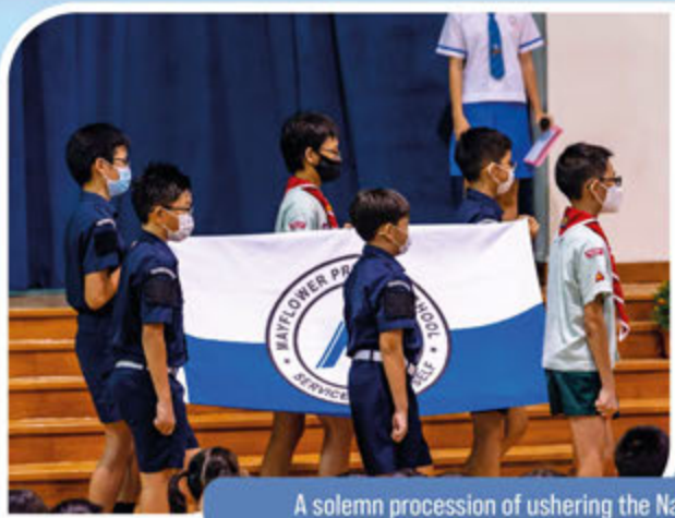
A solemn procession of ushering the National and School Flag by senior members of our uniformed groups into the school hall to start the celebration