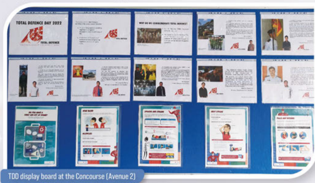
TDD display board at the Concourse (Avenue 2)

Our students were able to learn more about the six pillars of Total Defence; Military, Civil, Economic, Social, Digital and Psychological during their FTGP lessons. For example, our Primary 1 and 2 students learnt about safety in school, Primary 3 students learnt about saving water, Primary 4 discovered more about cyberwellness while Primary 5 and 6 students worked on their TDD mini-booklets. As an extension activity during Social Studies, our students had the opportunity to learn the sign languages for the six pillars. Display posters and write-ups were put up at the concourse to allow our students and staff to read more about how their teachers/colleagues play a part in Singapore's defence as well as information about first-aid.