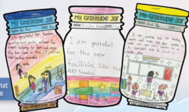
Heartfelt messages expressing students' appreciation for what have been done for them at the Avenue 5 upgraded premise

During the first week at our upgraded campus, our students penned their thoughts onto "Gratitude Jar" cards. They expressed words of gratitude and encouragement as well as their hopes and dreams for the future, and these "Gratitude Jar" cards were displayed in all the classrooms. We look forward to continuing our journey together at our new campus, daily creating exciting new stories together, and always with an attitude of gratitude.