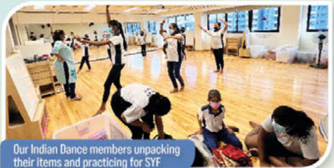
Our Indian Dance members unpacking their items and practicing for SYF