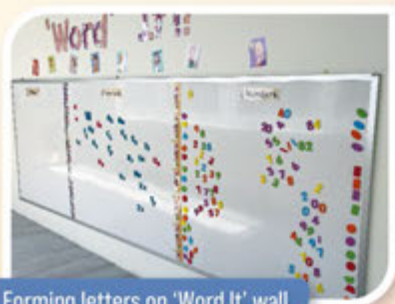
Forming letters on 'Word It' wall

A new ' Word It ' wall was created for children to learn the formation of letters in the alphabet and eventually learn to form words and then write them out themselves. This learning area helps to extend our children's language and vocabulary skills via learning from their peers. ' Peg-gy's Wall ' provides children with another avenue to develop their fine motor and artistic skills. This purposeful play enables them to develop social-emotional skills such as problem solving and cooperation.