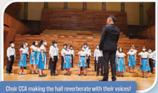
Choir CCA making the hall reverberate with their voices!

It was a long-awaited return for the Singapore Youth Festival (SYF) Arts Presentation this year. Our students began their tough preparations since the beginning of the year, waiting in anticipation for the official announcement of the SYF's resumption. Although this year's Arts Presentation does not come with an award category, our teachers and students welcomed the opportunity to perform on the big stage once again. We are proud of our students' ability to showcase their skills to the public.