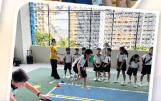
Upper primary students cheering for their classmates and players shaking hands at the end of a good game