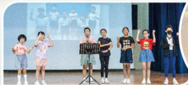
Our Hearing Loss students' skit