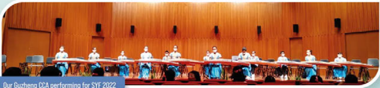
Our Guzhang CCA performing for SYF 2022

Here are the winners for the Malay Writing Contest conducted by EDN Media Pte Ltd.