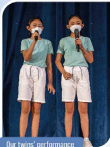
Our twins' performance