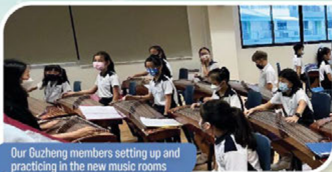
Our Guzheng members setting up and practicing in the new music rooms

As Singapore opened up gradually over the year, we saw the return of face-to-face CCA practices and many national events such as the National School Games (NSG) and the Singapore Youth Festival (SYF) Arts Presentation. It was a difficult season for many of our students and teachers, as the runway to the commencement of the competitions and performances was very short. Additionally, students and teachers had to juggle with settling into the new school building and making sure that the necessary equipment and infrastructure was in place. However, our students exemplified the mindset of 'Persist - Do it!' and continued to train and practice to the best of their abilities.