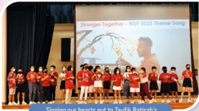
Singing our hearts out to Taufik Batisah's NDP theme song - Stronger Together