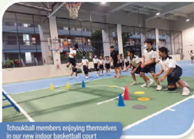
Tchoukball members enjoying themselves in our new indoor basketball court