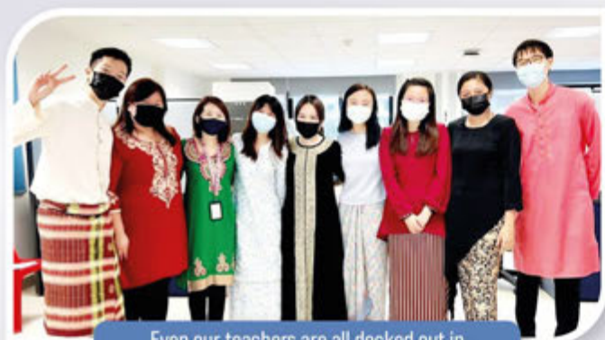
Even our teachers are all decked out in their multi-ethnic attire!

Our students were given time to reflect and celebrate Singapore as a harmonious society built on a rich diversity of cultures through the lessons and activities conducted during FTGP. Some of the activities that our students had were reciting the Racial Harmony pledge, the Orange Ribbon lesson and role-playing demonstrating appropriate actions to encourage racial harmony. Besides the lessons and activities, some of our students came to school in their ethnic costumes.