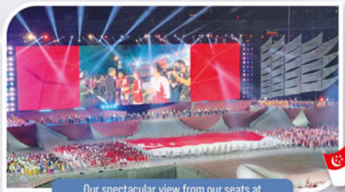
Our spectacular view from our seats at the Light Green Sector. Cool, huh?

"We were grateful to be able to see the Total Defence Display – the technologically advanced assets from the Singapore Army, the Republic of Singapore Navy (RSN), the Republic of Singapore Air Force (RSAF), the firefighting, first aid and counterterrorism operations. We felt so much joy when we heard the dazzling fireworks, our national anthem and pledge."