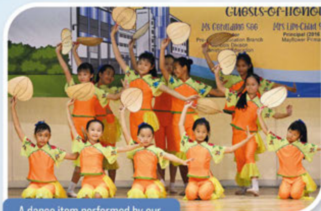
A dance item performed by our Chinese Dance CCA dancers