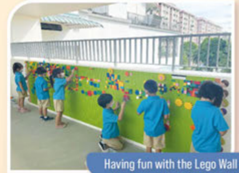
Having fun with the Lego Wall

Here are the pictures depicting how the walls around the new campus are transformed from a blank canvas into a masterpiece of captivating learning walls which allow children to make sense of their own experiences while interacting with the materials available. For outdoor, we have a new vertical ' Lego Wall ' which is created entirely from Lego bricks. Our children can build different structures using their imagination under the supervision of our teachers. This hands-on activity area also helps our children develop their hand-eye coordination, creativity and imagination, social and emotional skills.