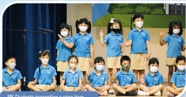
MK Students presenting a song item using both their voices and hand signs