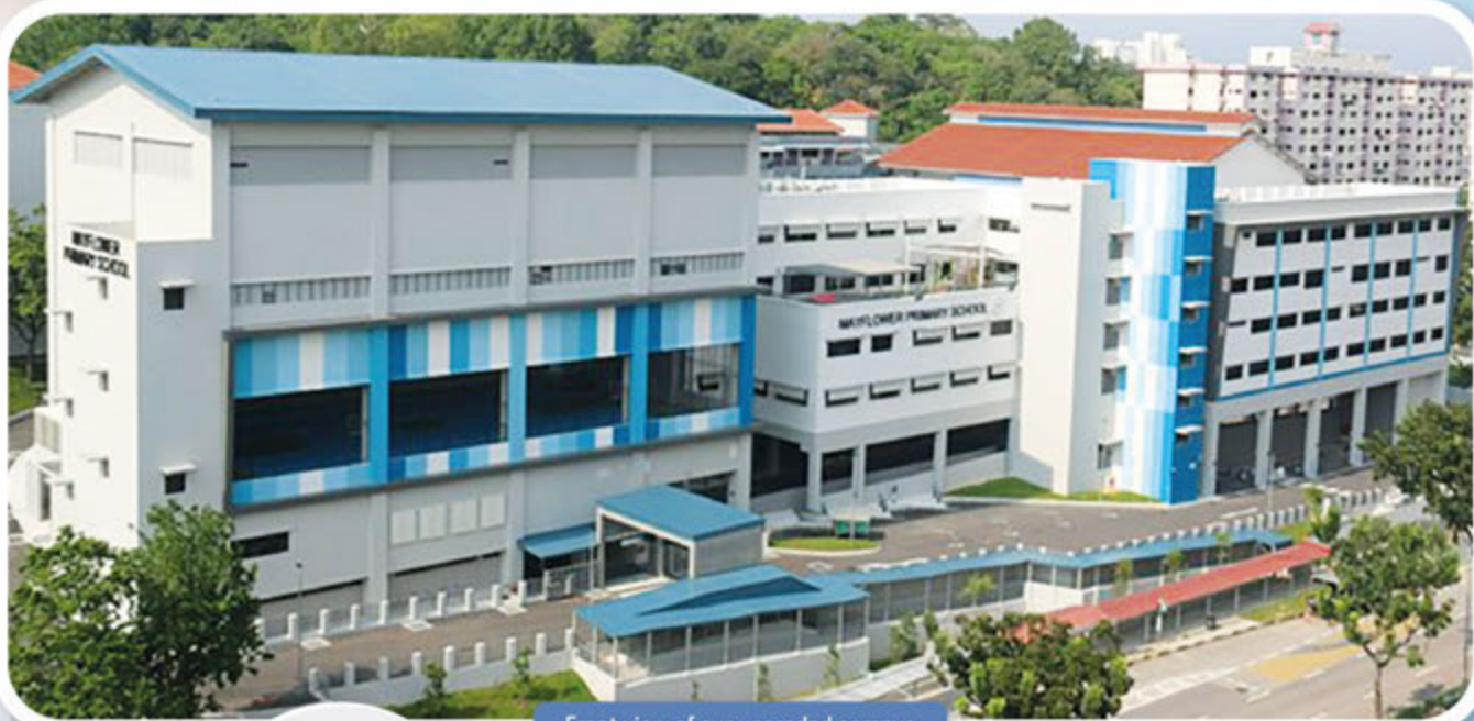
Front view of our upgraded campus