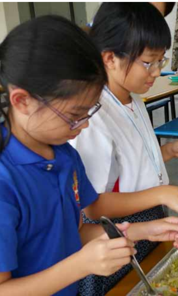
This page (bottom): Be grateful with what I have