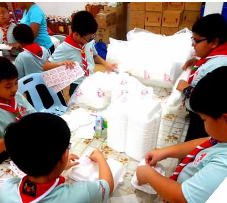
This page (top): Our cub scouts with their Frank Coopers Award

The Mayflower Primary School Cub Scouts seeks to develop each child holistically through a variety of weekly activities that emphasises the school's Core Values of Integrity, Respect, Resilience, Commitment to Excellence and Willingness to Lead and Serve. For instance, Cub Scouts would get the opportunity to participate in enriching programmes such as the annual Job Week, during which Cub Scouts learn how to raise funds by completing chores for other people. These chores range from helping a neighbour to spring clean her house to gardening. Such an experience has great potential to nurture our Core Values in our Cub Scouts. Additionally, a strong emphasis is placed on the building of discipline and teamwork through weekly activities like foot-drills, marching and team games/sports.