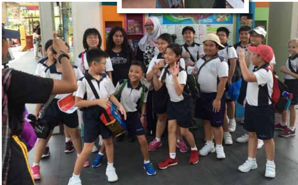
This page (top): Pupils posing with a seal at UWS