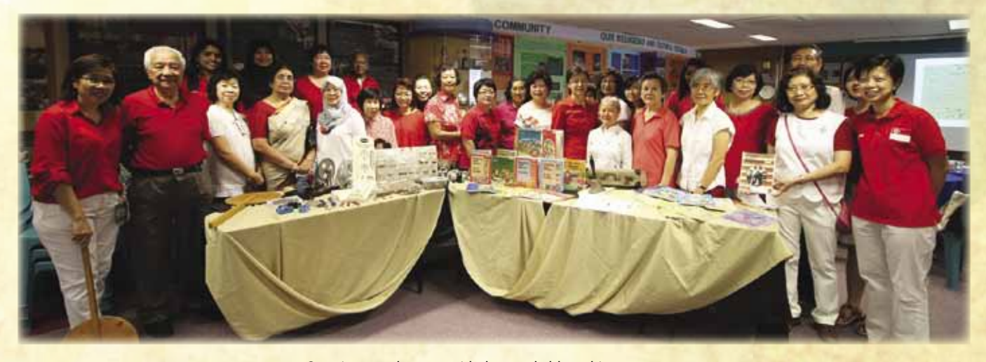
Our pioneer educators with the good old teaching resources.