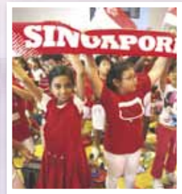
Singing along to our favourite National Day songs.