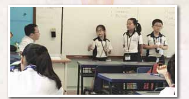
Environment Champions' Workshop.

MFPS attained the Lotus Sustained Achievement Award and Gold Award in the SEC-Starhub School Green Awards (SGA) and 3R Awards respectively. The School Green Award conferred by the Singapore Environmental Council, affirms the efforts taken by the school to nurture, inspire and encourage pupils to play their part in protecting the environment. The 3R Awards recognise the various programmes that have been put in place to inculcate the habit of practising the 3Rs – Reduce, Reuse and Recycle, among pupils. The school will continue to educate pupils to be good stewards of the environment by engaging them through effective and creative ways.