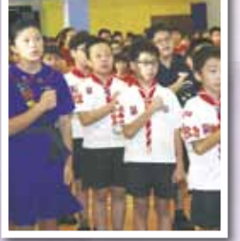
Pupils reciting the Pledge in unison.