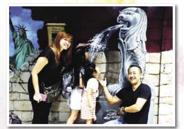
Having fun as a family.