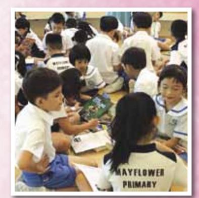
Look! Great books.