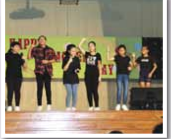
Enthusiastic 5C girls dancing to 'Titanium'.