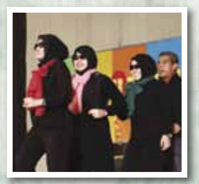
A dance performance by our versatile teachers.