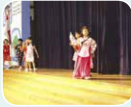
Little fashionistas showing off their pretty costumes.