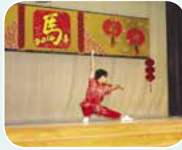
A performer from Jin Yuan Wu Shu showing off his skills.