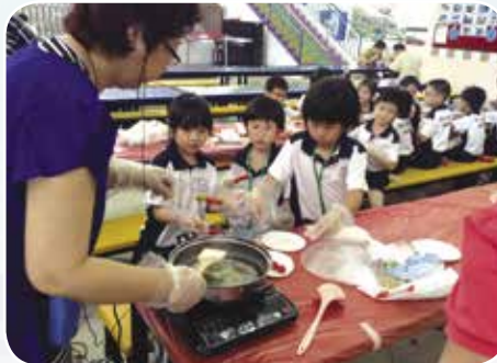
Pupils lining up to coat their 'bing tang hu lu' in syrup.