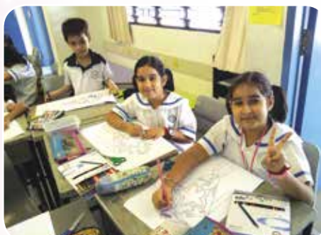
Kite-making is an unforgettable experience.