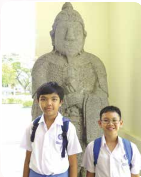
Look at the magnificent sculpture behind us!