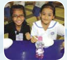
We have finished our food!