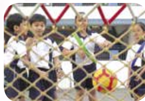
Time for target practice.