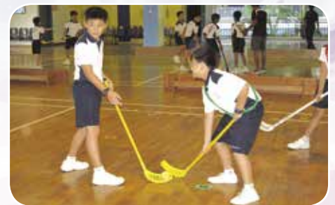
Are we starting soon?