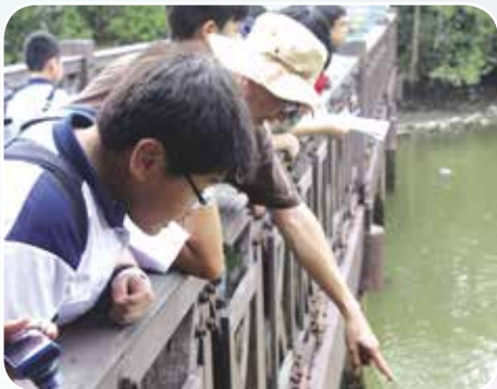
Do you see what I see?