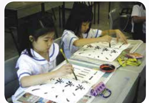
Primary 3 pupils practising Chinese calligraphy.