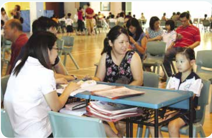
Can you share your success stories?

MFPS recognises the importance and value of partnering parents for the holistic development of pupils. In line with this belief, the first PCTC was held at the end of Term 1 to provide feedback to parents on the general progress and development of the child. Pupils took greater ownership of their learning by sharing their learning experiences. Through PCTC, quality relationships with parents were forged as mutual respect, trust and commitment were built to better support pupils' learning.