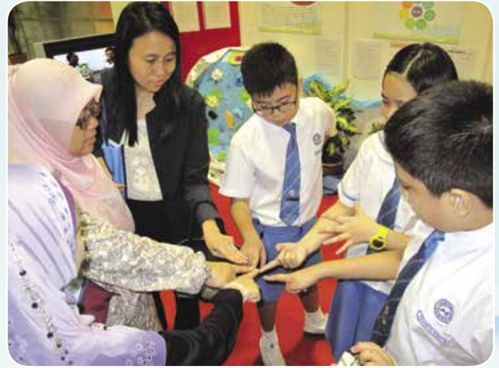
Using a Tableaux (Freeze Frame) to understand fractions.