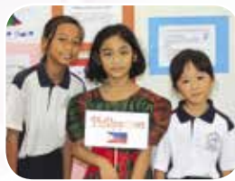
Greetings from Philippines.