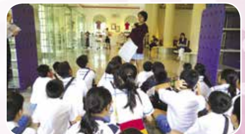
Pre-briefing done by a curator.