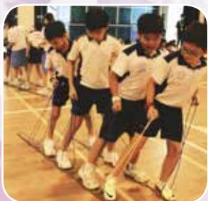
Working together to achieve a common objective.

Aligned to the school's belief, "Every Pupil, A Leader", the leadership training for captains and group leaders serves as a platform to groom pupils into leaders. During the training, pupils participated in various games and through them learnt the importance of good leadership and teamwork.