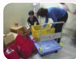
Sorting out the different types of perishable food items.