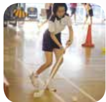
This is easy enough!

In line with the Physical Education Syllabus 2014, the Games Carnival enabled pupils to demonstrate individually and with others the school core values and physical skills. The PE Department organised a series of games for the upper primary pupils over three days. Pupils played floorball, tchoukball, ultimate frisbee, modified netball, rounders, soccer, newcombe and modified basketball. The Carnival provided pupils with a rich learning experience and the opportunity to try out a greater variety of games. It also encouraged them to lead an active and healthy lifestyle.