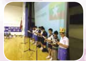
5A pupils presenting a Readers' Theatre on 'The Four Puppets'.