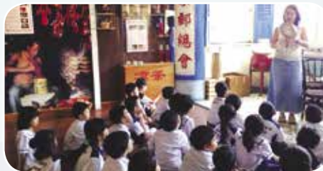
Interesting history of the stamps.