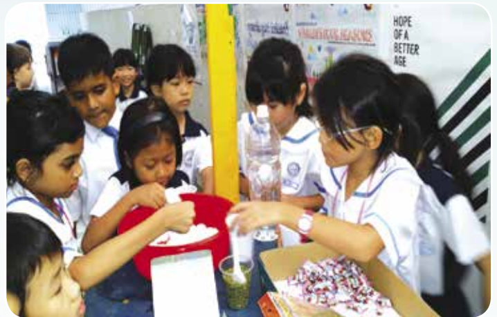
Eco Rangers demonstrating to schoolmates how to grow and take care of green bean plants.