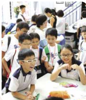
Pupils sharing their experiences during Art Lesson.