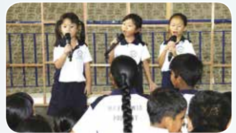
Do you like our singing?