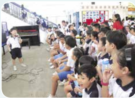
Enjoying the limelight!