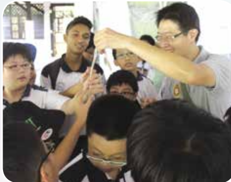
This is how a snake skin feels like.