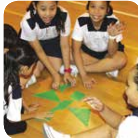
Solving puzzles as a team.