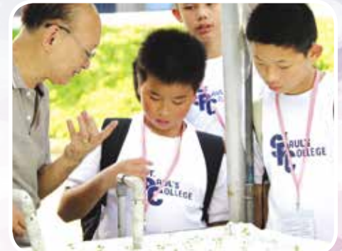
Learning more about Hydroponics.

The High Progress Committee had the privilege of organising a visit by staff and pupils of St Paul's College Primary School from Hong Kong on 2 May 2014. Thirty-six pupils, together with accompanying teachers, were in Singapore for an overseas cultural immersion programme. The visitors were engaged in a hands-on Art lesson and participated in Indian and Malay dances. They also enjoyed a food-tasting session of local delights.