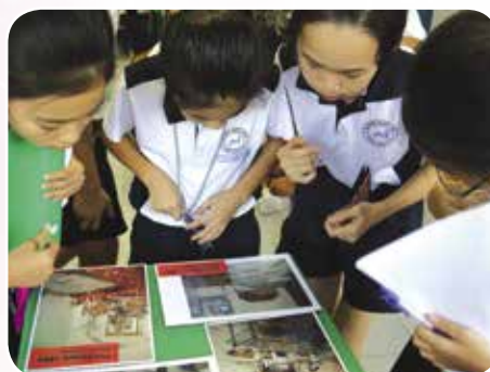
What is missing in the CSI game?