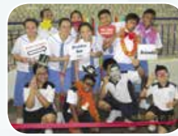
Kudos to the Prefects and CCE Captains who helped make Friendship Week a success.