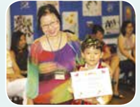
Yeah! We won first prize for the best classroom decoration.