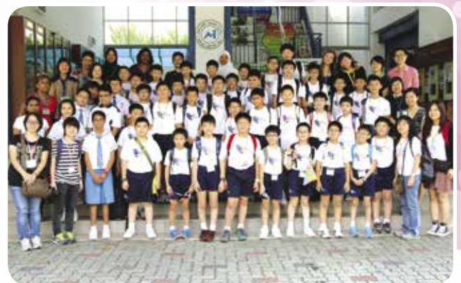
A group photo with our visitors.