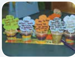
Colourful Friendship Trees which serve as a reminder that we are unique individuals with a common goal.