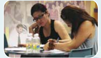
Hands-on session for parents.

A series of parents' workshops were organised as part of the school's effort to equip parents in providing support for their children's learning and development at home. These workshops, covering English, Mathematics, Science and Mother Tongue, were conducted for all levels.