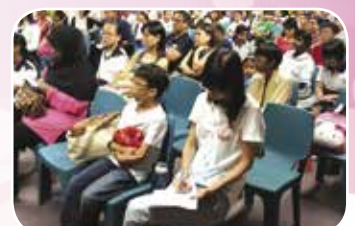
Parents and pupils listening to the talk.