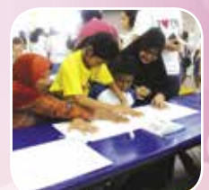
Expressing the love between mother and children.