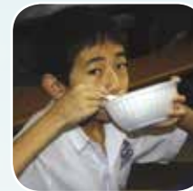
Do not waste precious food.