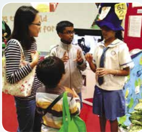
Mis-Understood Fraction visits the pupils in MFPS to help them understand the concepts of fractions.