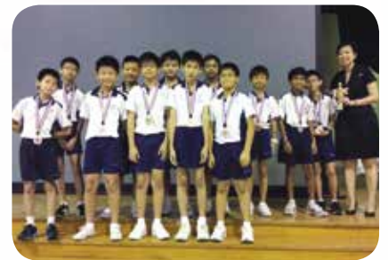
Congratulations to the Senior Division Boys for winning the Bronze award at the 7th SPH Foundation Zonal Primary Schools Tchoukball Championships 2014.