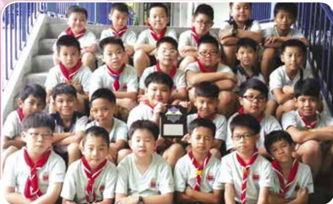
Congratulations to the Scouts for winning the Silver award in the Frank Cooper Sands Award 2013.