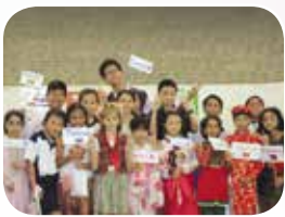
The United Nations of Mayflower.