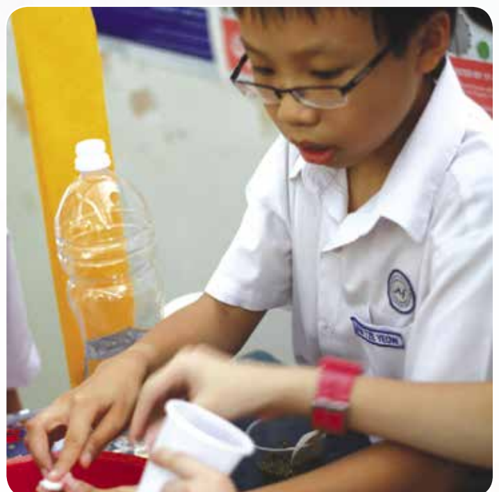
This is how a seed should be planted.