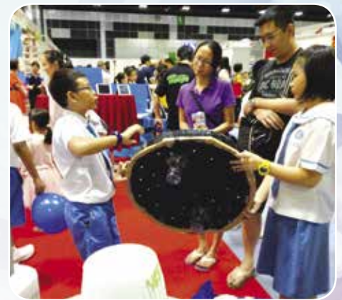
Pupil presenters demonstrating the use of circular props for the topic on circles.