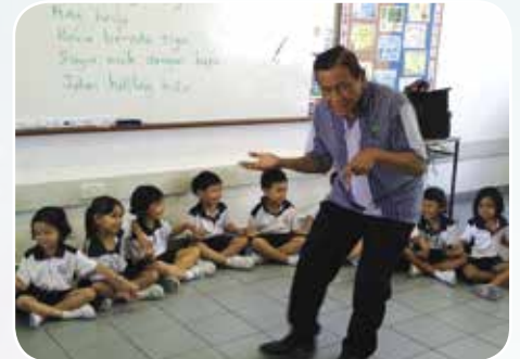
Having fun singing together.