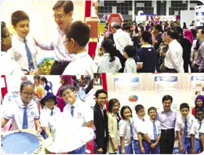
Integrating Drama with Math - photos from Minister Heng Swee Keat's Facebook page.