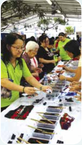
Let me show you how it is done.