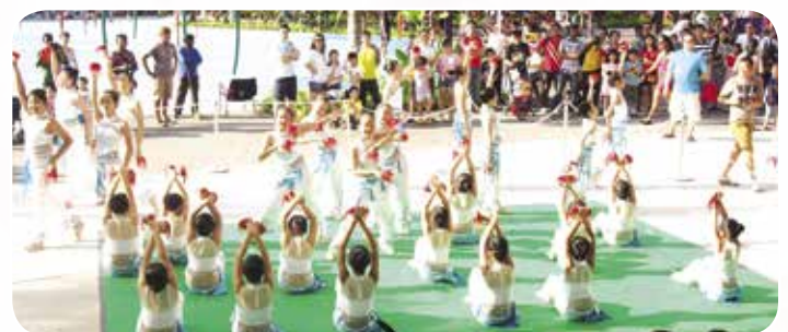
Chinese dancers performing a Yin tribal dance.