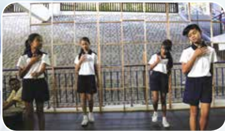
How did we perform?