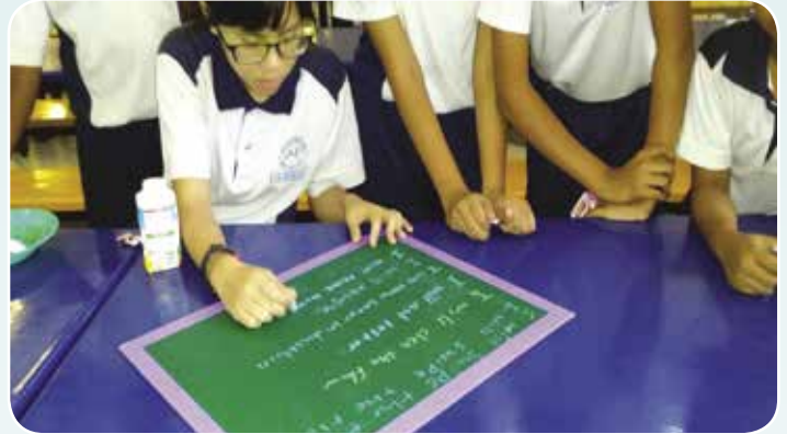
Taking the pledge is one way to remind myself what I can do to save the environment.