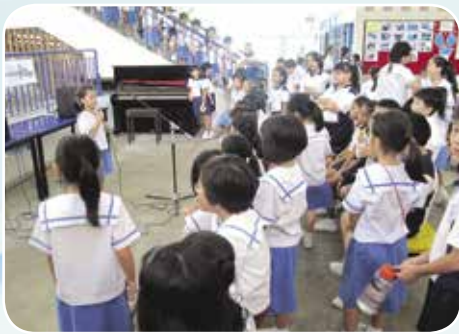
Supporting our friend.

ACEplanade is a platform for non-auditioned performances that aims to Aspire, Cultivate and ultimately allows pupils to Express their artistic talents. Pupils keen in performing voluntarily sign up with their Music teachers. The performances, which take place on the last Thursday and Friday of each term at the upper canteen, provide opportunities for pupils to showcase their talents in the performing arts. These performances are well-received by the pupils.