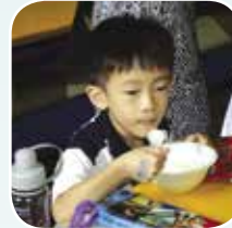
Hmmm...not too bad.