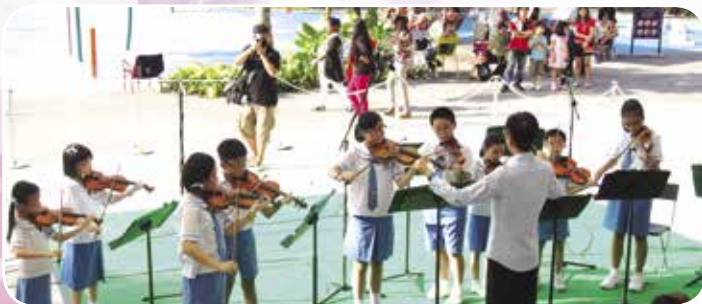
String Ensemble and their conductor.

The MFPS String Ensemble, Indian Dance and Chinese dance groups were invited to perform at the Gardens by the Bay for the second consecutive year on 23 March. It was a golden opportunity and a distinguished platform for the pupils to showcase their talents at the newly-opened Far East Organisation Children's Garden.