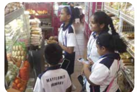
Trying some Indian snacks.