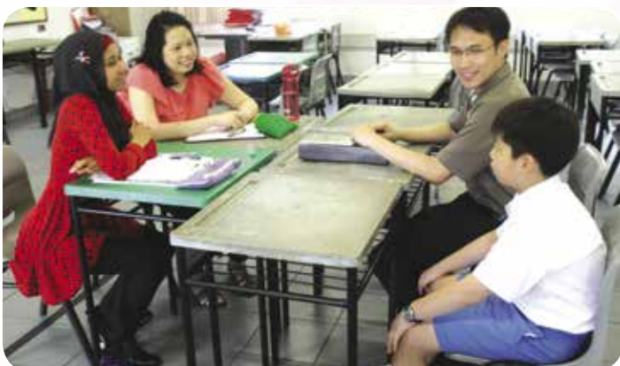
A pupil sharing his learning experience.