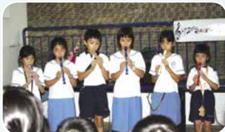
Performing a song that we learnt in Music class.