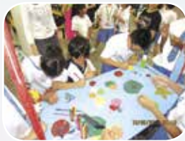
Writing friendship notes to friends.