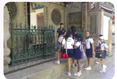
Waiting to explore the Thian Hock Keng temple.