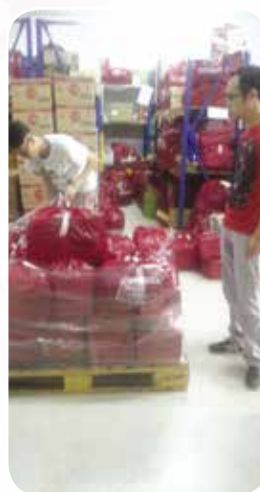
Securing the packed goodie bags for delivery.