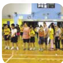
Getting ready for the second telematch bonding activity.