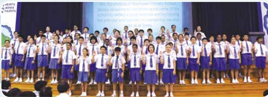
Prefects of MFPS reciting the pledge with pride and dignity.

The Prefects' Investiture was held on 18 February 2014. It was a significant event during which the school affirmed its Pupil Leaders. It served as a milestone for prefects as they accepted greater leadership responsibilities in school. During the ceremony, the prefects took their oath and were challenged to epitomise one of the school core values, 'Willingness to Lead and Serve'. The event was graced by the school leaders, teachers, pupils and parents of the appointed prefects.