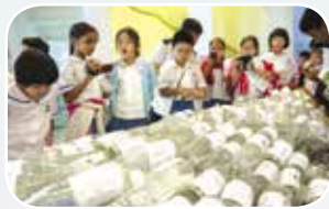
Messages in a bottle.