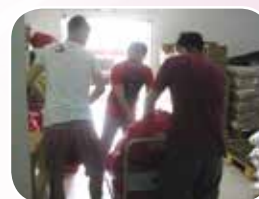
Here's our 'man'power!