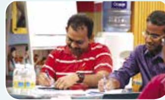
Back to school again!