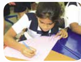
A message for a special friend.