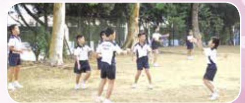
Catch it before it falls.