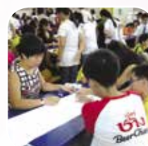
Let's do this together, Mum!