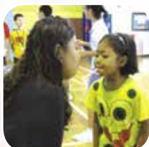
Mummy... here is my rubber band.