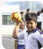
I can do this!