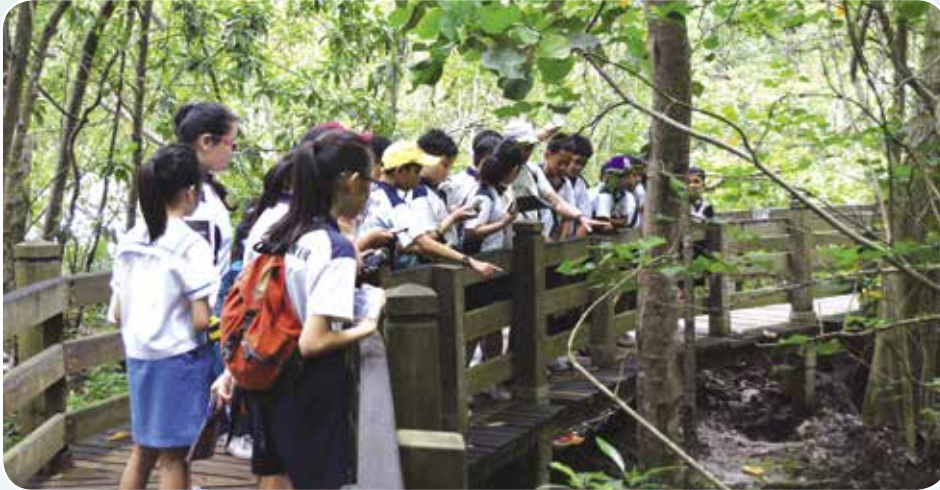
Observing the trees and their characteristics.

Primary 6 pupils went on a learning journey to Sungei Buloh Wetland Reserve in May organised by the Science Department. The authentic learning environment was excellent for the observation of organisms in their natural habitat. Pupils forged a better understanding of the complexity of interactions between organisms and the environment. Through experiential learning, pupils acquired a greater appreciation of the rich biodiversity and gained a deeper understanding of the importance of conservation.