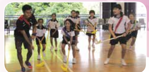
Hey, you are too fast!