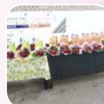
Bouquets of roses and gifts for mothers.