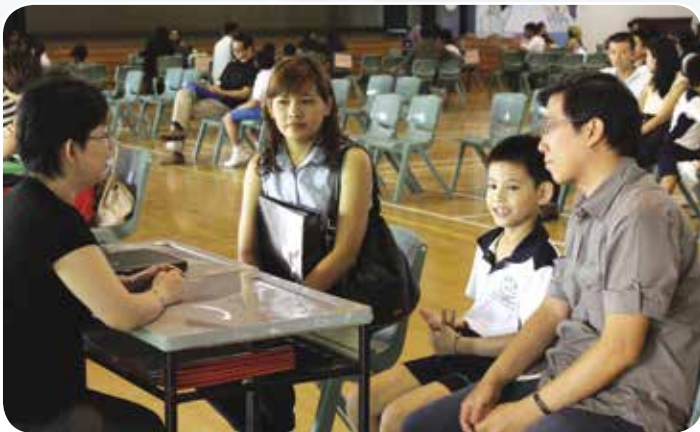
What do you like about school?