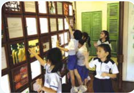
Let's see what are in these boxes.