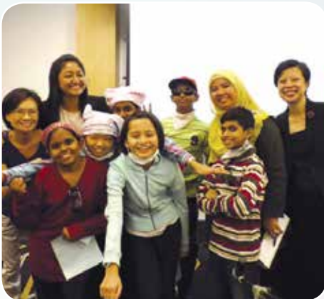
Staff and Pupil presenters for Place-Based Learning - An Integrated Approach to Learning English, Visual Arts and Social Studies.