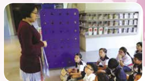
Listening attentively before we start exploring the museum.