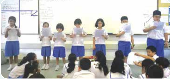
Characters reading the scripts.

The annual English Oracy Week was held in conjunction with International Friendship Day. Pupils carried out Readers' Theatre based on the theme 'Stories We Share' with scripts on Asian folktales. This allowed them to learn more about the different Asian cultures and provided them a platform to build their confidence through the presentations.