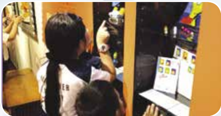
Wow! Look at these beautiful stamps!