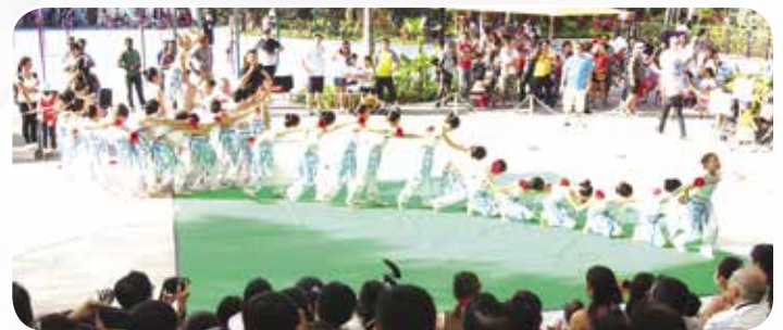
Chinese dancers wowing the audience!