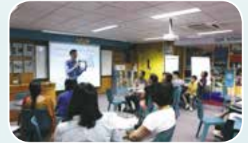
Using ICT in Science.