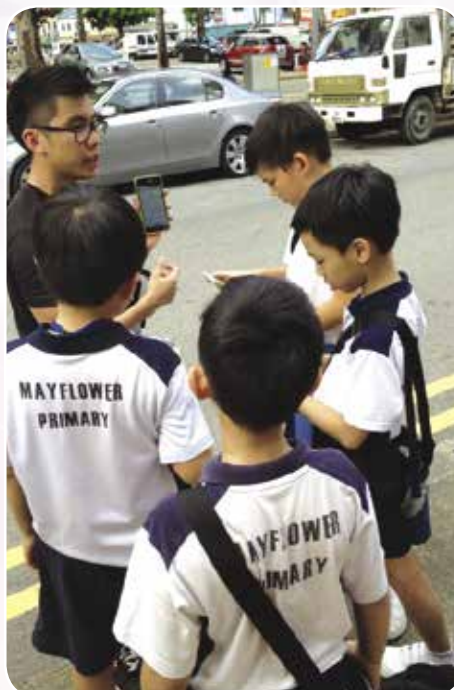
Off we go to the next checkpoint!