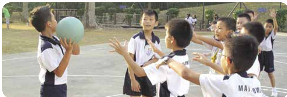
Get ready to catch.