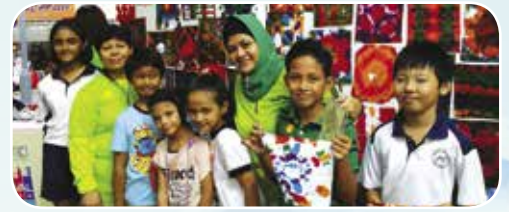
Happy participants with their designs.

MFPS Art Department partnered Yio Chu Kang Community Club to present a Tie and Dye interactive art booth at Ang Mo Kio Central on 1 June 2014.