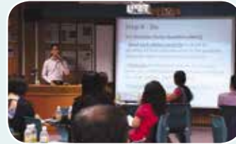
Sharing on Polya Thinking Routine.