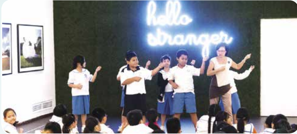
Practising being a grasscutter.