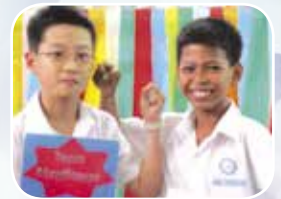
Creating fun and lasting memories at the photo booth.