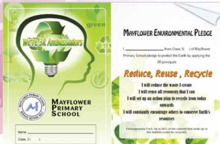
Green Education Booklet

In the Corporate and School Partnership Programme Environment Project Competition, MFPS clinched the Merit Award and Bronze Certificate for Sustained Partnership with MFPS's corporate partner, Seagate Technology International (STI). Last year, Primary 4 & 5 Science Captains, together with volunteers from STI, designed a booklet which promoted 3R (Reduce, Reuse, Recycle) activities. The booklet covered 3R activities that pupils could do in school as well as at home. The programme was rolled out to the Primary 3 cohort who enjoyed doing these activities as they learnt how to care for the environment.