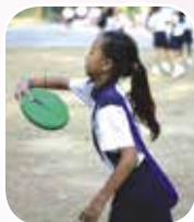
This is how you hold a frisbee!