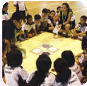
Strategising as a group in Mega Othello.