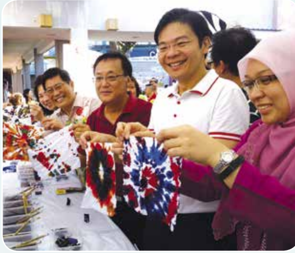
Sunburst tie-dye designs done by our GOH.