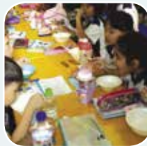
How's the food?