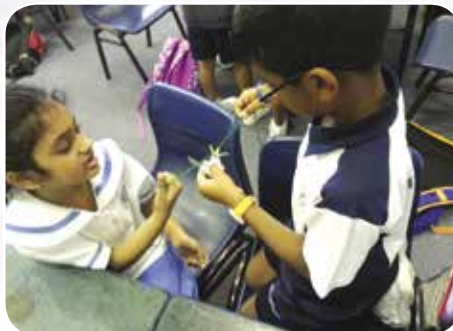
Am I threading the flowers correctly?