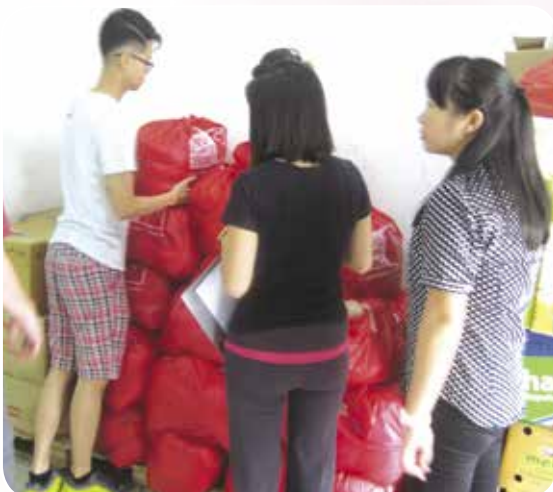
Counting the rice stock.