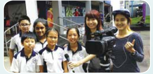
Pupils with PAssionArts Festival reporters.