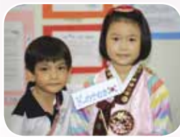
My friend from Korea.