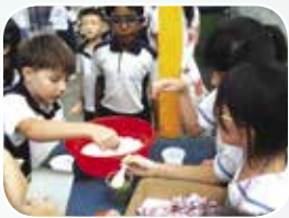
Eco Rangers spreading the environmental education message to friends.