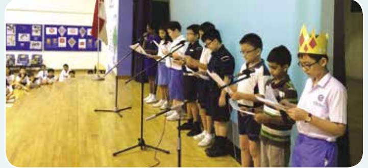
Pupils presenting to the school.