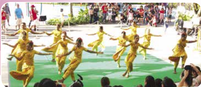
Indian dancers dancing to the rhythm of the music.