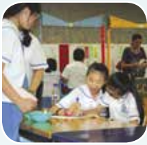
We've learnt a lot today.