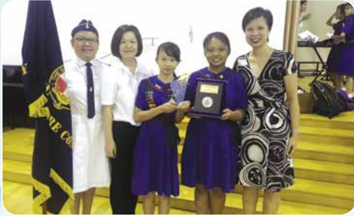
Congratulations to the Girls' Brigade for achieving Gold in Company Awards 2013, Sustained Gold Award for 10 Years and the Silver award for the National Drill Competition 2014.