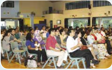
A proud moment for parents!