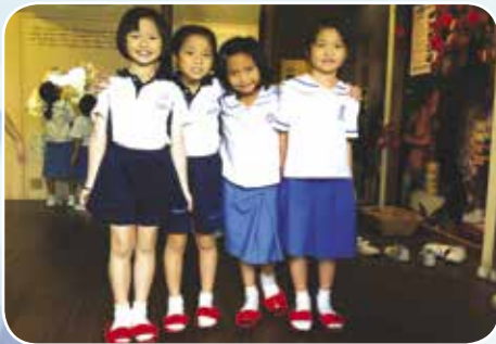
What do you think of our footwear?