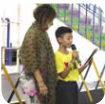
Words of appreciation to my mummy.