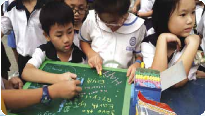
Mmmm... what should I do to save the environment?

MFPS clinched the Lotus Award, the top of the four award levels, for the School Green Awards 2013. Launched in 2000, the School Green Awards (SGA) is an environmental audit programme for schools. Pupils work in teams to audit their school before submitting a report on their environmental efforts. As such, the school has taken measures to address issues such as waste minimisation, resource conservation and greening of the school grounds. The school is also encouraging pupils and staff to take on greater ownership in environmental activities and management of resources. As a result of these measures, the school has also been awarded the Gold Award for the 3R Awards 2013. Pupils and staff are conscious of the need to recycle, reuse and reduce whenever opportunities arise.