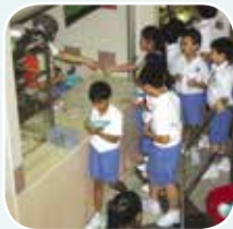
Queueing for plain porridge.