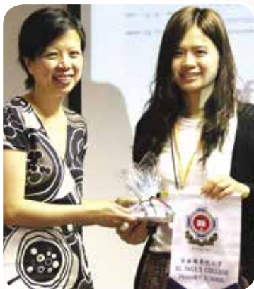
Exchange of tokens between the two schools.