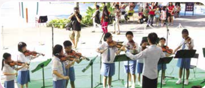
String Ensemble and their conductor.

The MFPS String Ensemble, Indian Dance and Chinese dance groups were invited to perform at the Gardens by the Bay for the second consecutive year on 23 March. It was a golden opportunity and a distinguished platform for the pupils to showcase their talents at the newly-opened Far East Organisation Children's Garden.