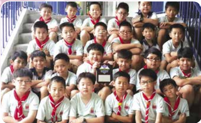
Congratulations to the Scouts for winning the Silver award in the Frank Cooper Sands Award 2013.