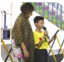
Words of appreciation to my mummy.