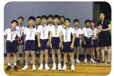
Congratulations to the Senior Division Boys for winning the Bronze award at the 7th SPH Foundation Zonal Primary Schools Tchoukball Championships 2014.