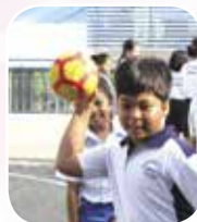
I can do this!