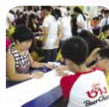
Let's do this together, Mum!