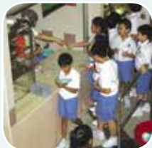
Queueing for plain porridge.