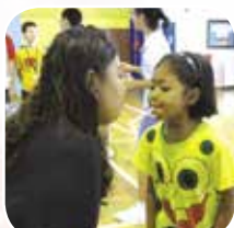
Mummy... here is my rubber band.