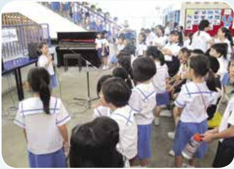
Supporting our friend.

ACEplanade is a platform for non-auditioned performances that aims to Aspire, Cultivate and ultimately allows pupils to Express their artistic talents. Pupils keen in performing voluntarily sign up with their Music teachers. The performances, which take place on the last Thursday and Friday of each term at the upper canteen, provide opportunities for pupils to showcase their talents in the performing arts. These performances are well-received by the pupils.