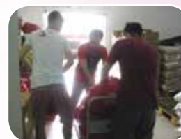
Here's our 'man'power!