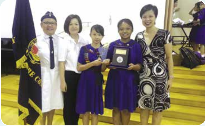
Congratulations to the Girls' Brigade for achieving Gold in Company Awards 2013, Sustained Gold Award for 10 Years and the Silver award for the National Drill Competition 2014.