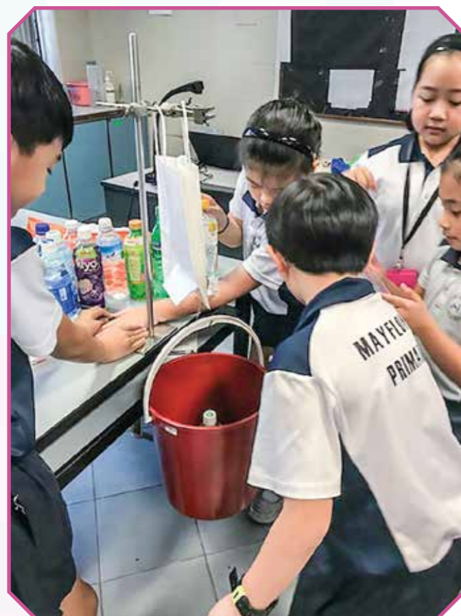
Let's start our experiment.

At MFPS, each department has started streamlining and re-designing their respective curriculum and work on encouraging every teacher to re-look their teaching pedagogies. This ensures coherence in the implementation of formative assessment as a whole school approach by having a greater alignment between curriculum, assessment and pedagogy.