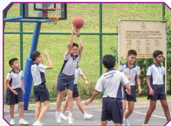
Yes! I got it!