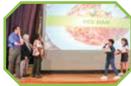
It's either Me or Mee Siam.