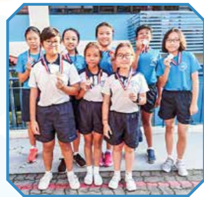
The P5 team achieved 2nd position in the Kids Netball Carnival.