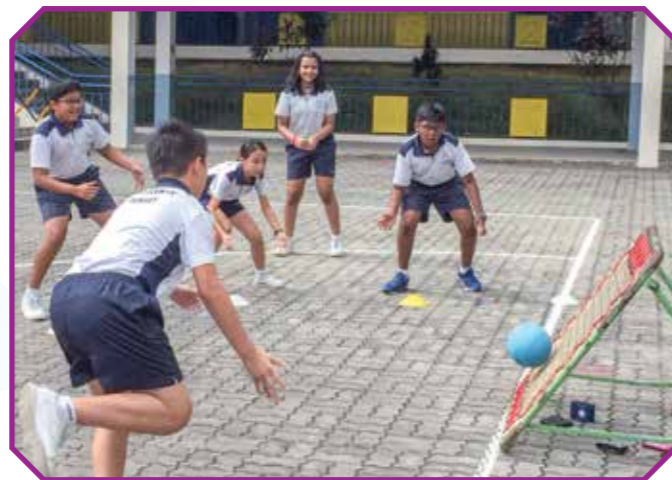
What a nice aim!