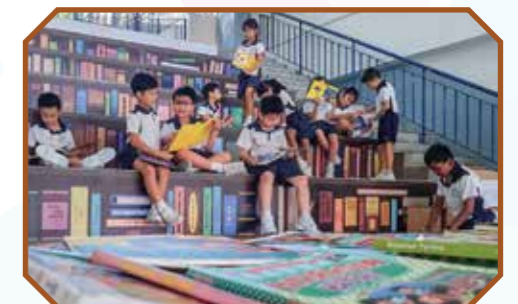
Reading on-the go