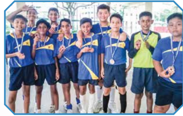
The soccer team clinched the 3rd position in the Soccerites Challenge.