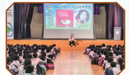
Talented actress and author Jeanette Aw is here!