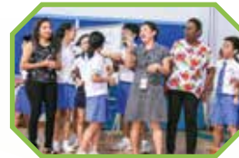
Anxiously waiting to be called.