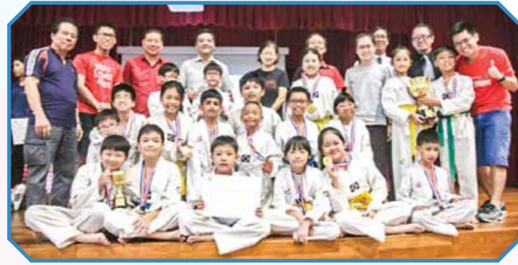
Overall Junior Champion of Whampoa CC Taekwondo Tournament 2018.