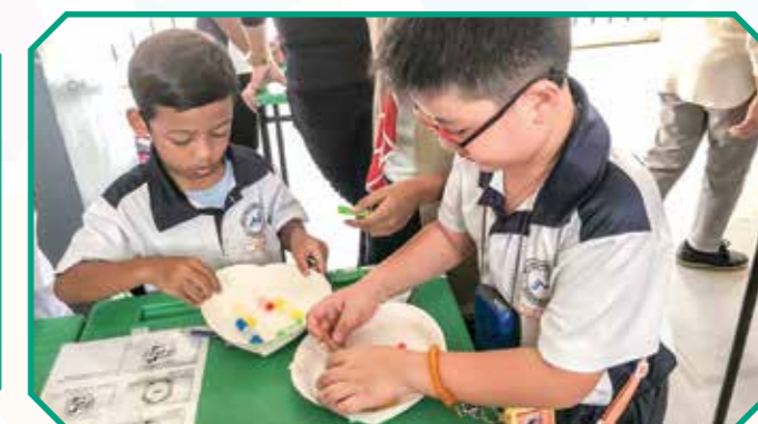
Student-facilitators at work - demonstrating and guiding fellow students to make their marble maze.