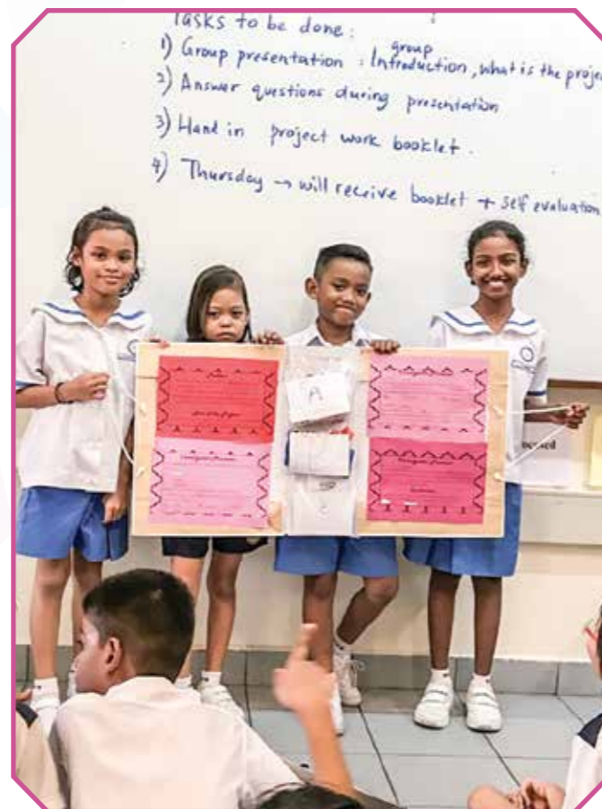
Look at our findings.