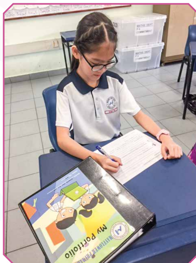
I need to craft my reflections based on my teacher's feedback.