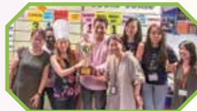
We are the champion!