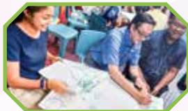
Let me draw that.