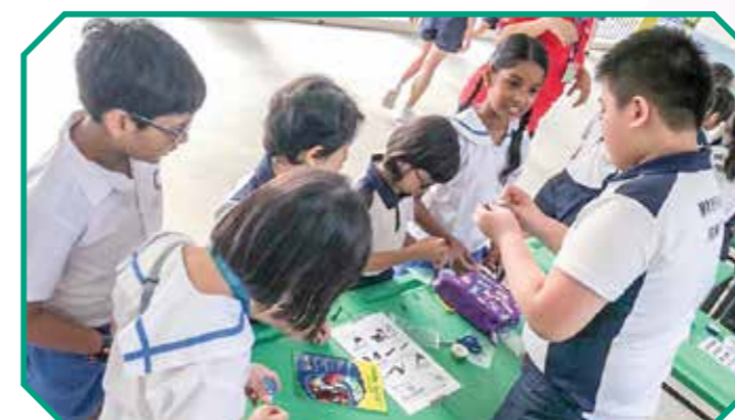
Let me show you how to get this LED diode working...