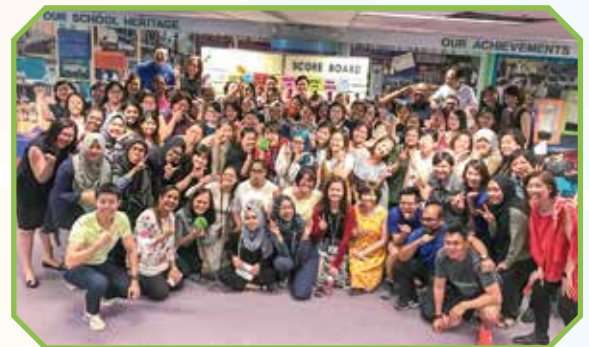
Such a gastronomic afternoon!