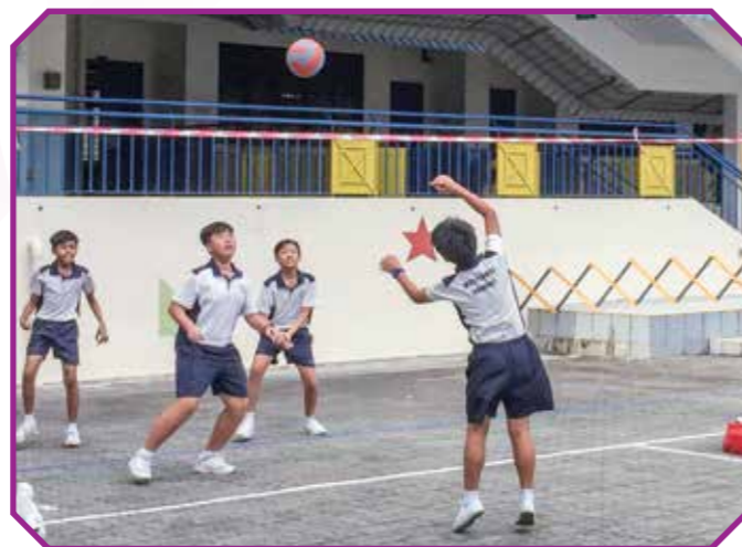
Come and get the ball!