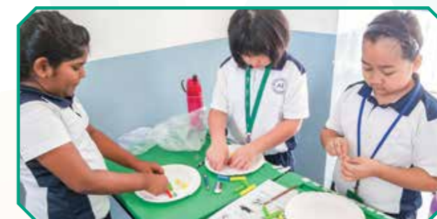
Students engaged in making their marble mazes.