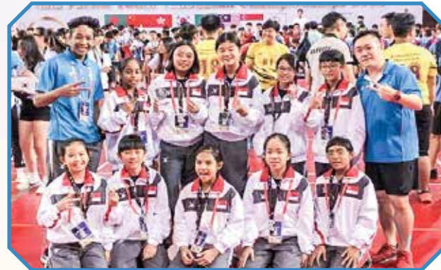
MFPS Tchoukball team members representing Singapore in the 5th Asia Pacific Youth Tchoukball Championships 2018.