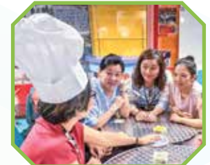
Let me share a secret recipe.