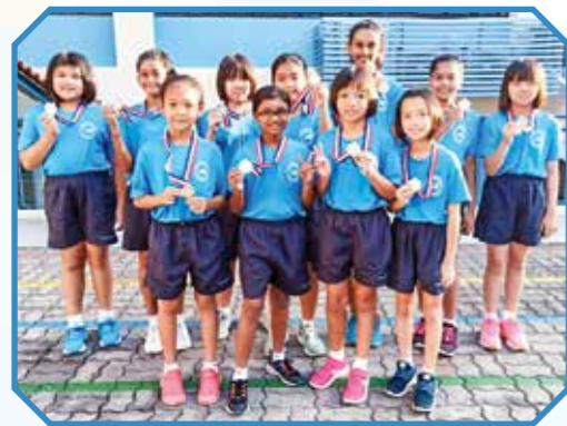
The P3 and P4 team achieved 1st position in the Kids Netball Carnival.