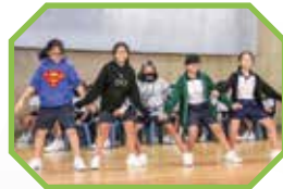
Hey...watch those steps!