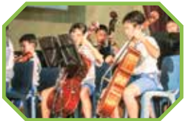
Strike those chords well!

After a wonderful performance staged by our own students, the MFPS Staff headed for some fun filled activities hosted by The Mind Café, a Board Games Cafe . The Mind Café carried out team-bonding activities where staff had to use their creativity and persuasion to make sure that their team wins the games. Through these activities, the staff had a wonderful time where they bonded with each other.