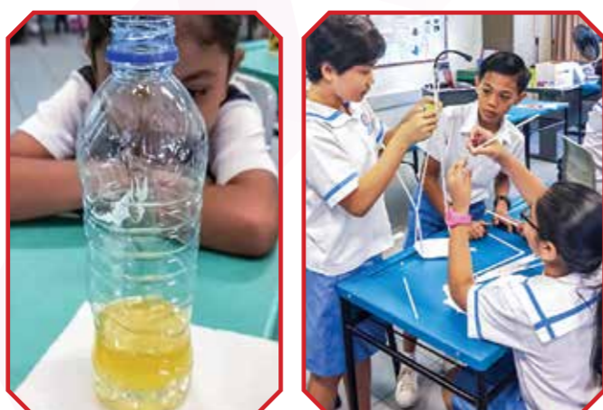
We can do this together!

Students from each level will also be acquiring at least two learning dispositions a year. They will learn what the learning disposition is, how it sounds, looks and feels like, during the interactive lessons. For example: