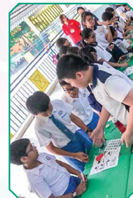
A bustling sight at Studio Atelier @ The Amphitheatre during InnoMakers tinkering sessions.