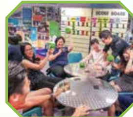
I am the durian king!