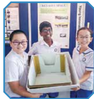
Presentation of prototype at the (IvP) Project Judging and Young Innovators' Fair.