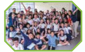
You have our support, teachers!